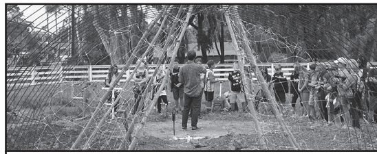
Coastal Roots Farm is home to a food forest in Encinitas, California.