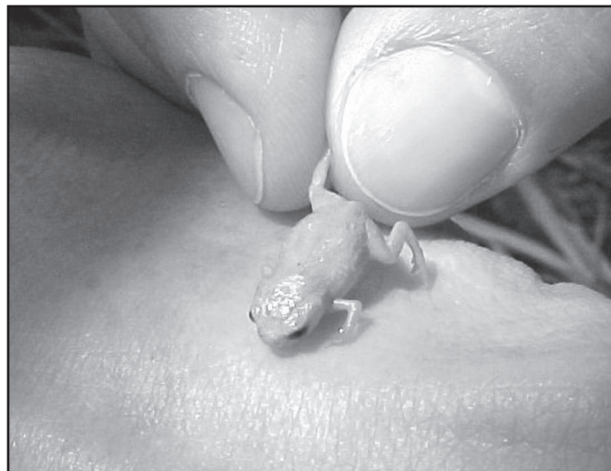
A Newly Discovered Frog