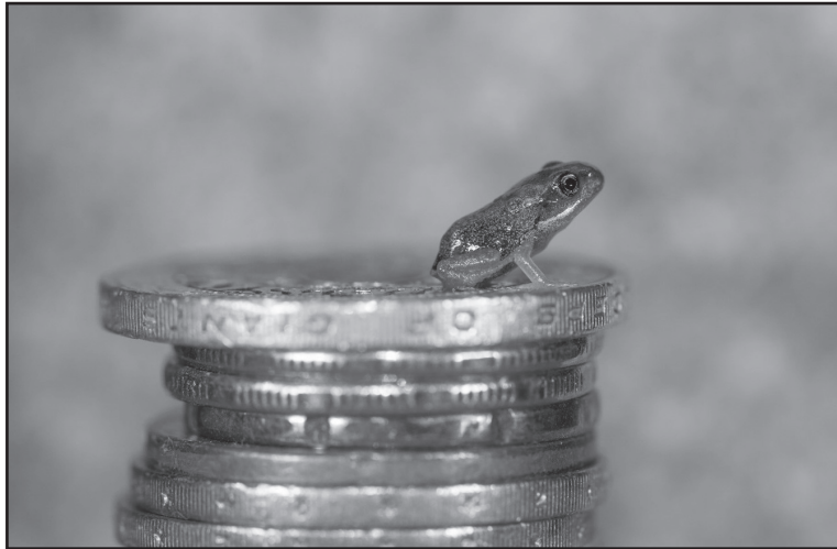
This tiny frog measures approximately 7 millimeters.